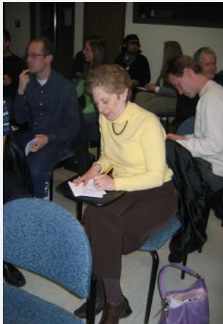
A scholar alum puts her finishing touches on a surrealist drawing.

“We are all scholars, and we all love to learn.